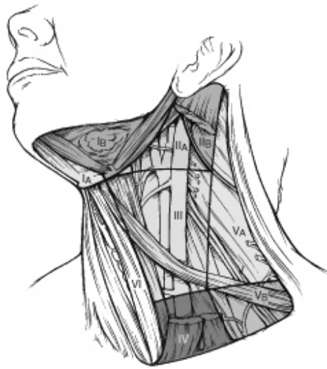
Figure 2. The six sublevels of the neck for describing the location of lymph nodes within levels I, II, and V. Level IA, submental group; level IB, submandibular group; level IIA, upper jugular nodes along the carotid sheath, including the subdigastric group; level IIB, upper jugular nodes in the submuscular recess; level VA, spinal accessory nodes; and level VB, the supraclavicular and transverse cervical nodes.

In order for pathologists to properly identify these nodes, they must be familiar with the terminology of the regional lymph node groups and with the relationships of those groups to the regional anatomy. Which lymph node groups surgeons submit for histopathologic evaluation depends on the type of neck dissection they perform. Therefore, surgeons must supply information on the types of neck dissections that they perform and the details of the local anatomy in the specimens they submit for examination or, in other manners, orient those specimens for pathologists.